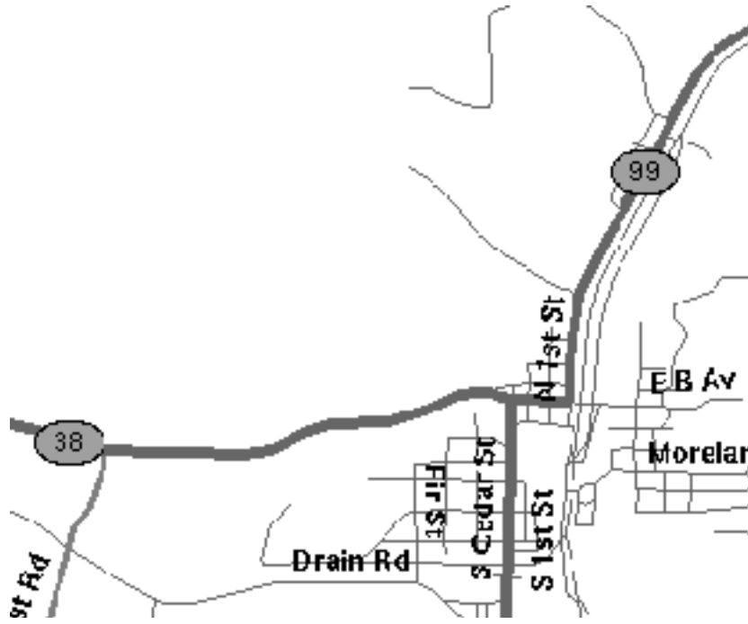
Map of Drain, Oregon