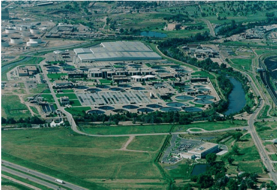
CENTRAL PLANT SITE BUILDING LOCATIONS